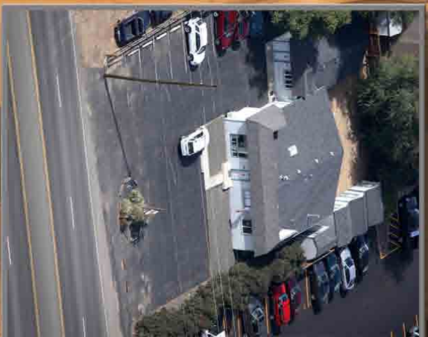
IMR World Headquarters

5135 Ward Road Wheat Ridge, Colorado 80033 USA