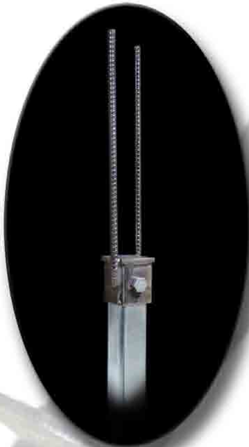
New Construction Rebar Cap