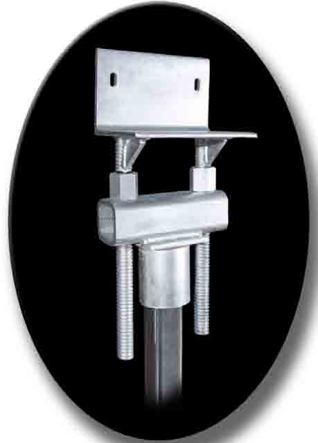
Underpinning Bracket (U.S. Patent 5,800,094)