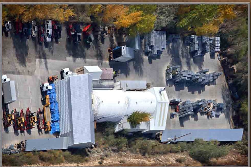
Engineering Test Lab Custom Fabrication Distribution