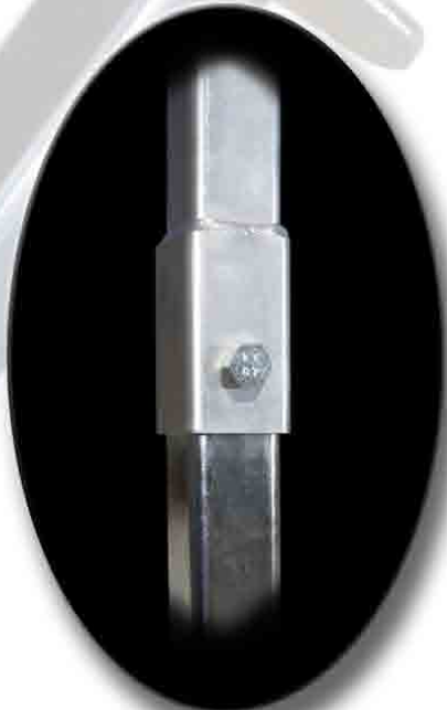
Precision Fit, High Strength Coupling